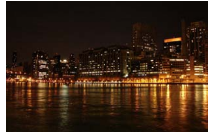
Verdant Power's Free Flow systems operate out of sight and silently underwater. Simple and modular, the systems can be scaled for placement directly in population centers ranging from cities to villages.