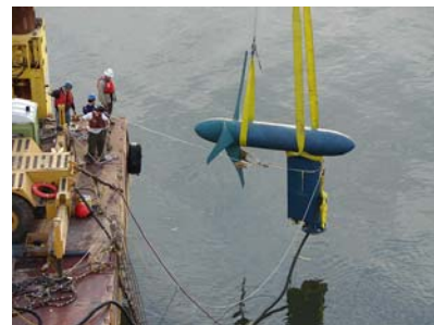
Verdant Power's Free Flow turbine being installed into NYC's East River in December 2006